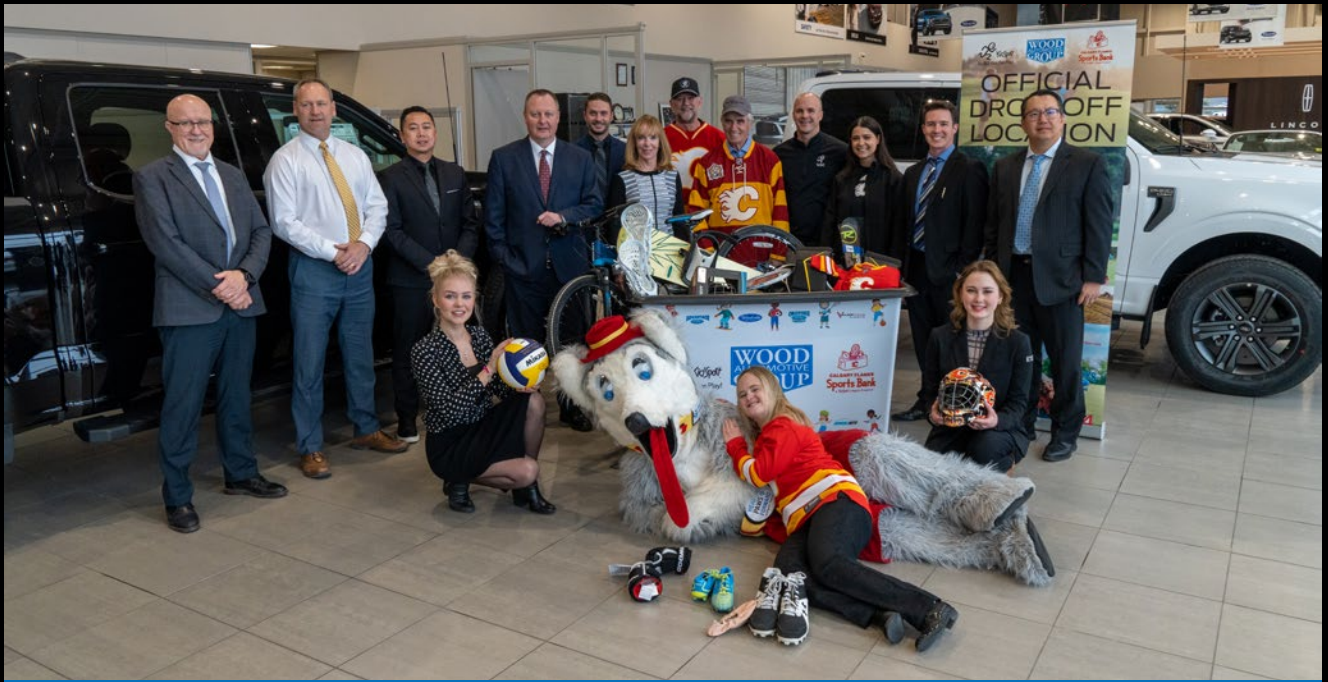
The WAG dealerships are official drop off locations for the Calgary Flames Sports Bank and KidSport Calgary, delivering more than 12,000 gently used items – so all kids can play.

syndrome along with an inspiration to everyone in the company.