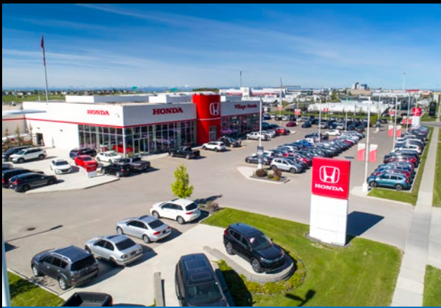
The new Village Honda location in the Northwest Auto Mall.