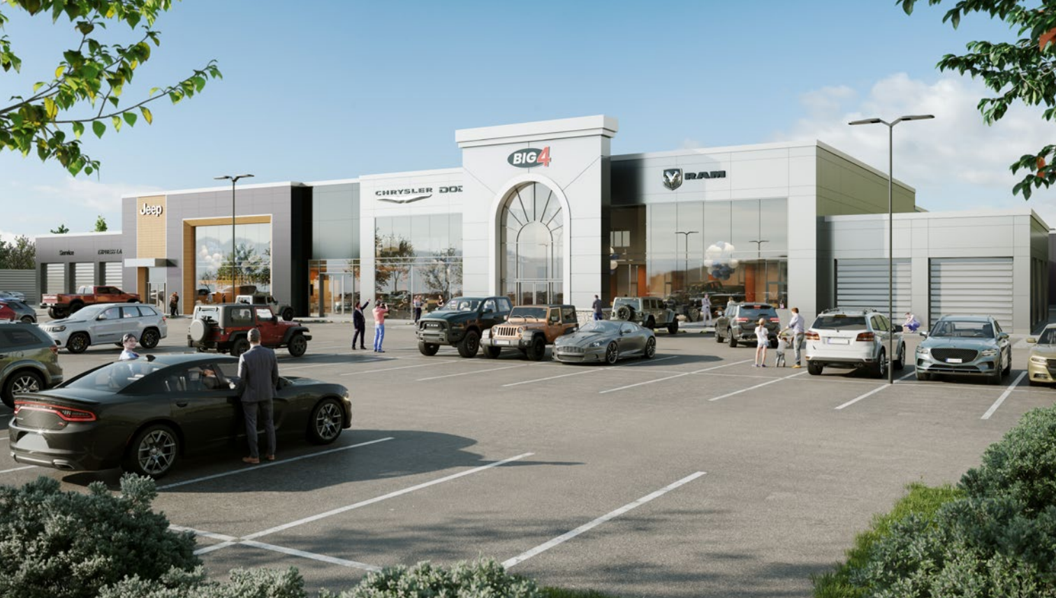
Big 4 Motors, the first Chrysler Dodge Jeep and Ram dealership in Canada build entirely on Indigenous land is set to open in Taza Park on the Tsuut'ina Nation.