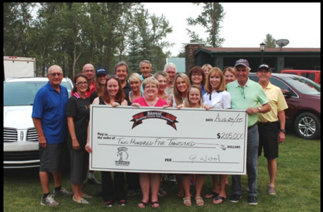
The Woodridge Charity Golf Tournament raised millions of dollars for the Woodridge PREP Centre, a school and resource centre for Down syndrome students and their families.

“Our parents have always taught us to look out for people who may need some help and I’m very proud of how we step up to support the community to make Calgary a better place to live,” says Megan Wood.