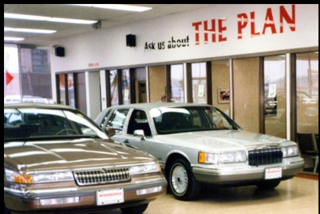
The Plan – Woodridge's ground-breaking 2-year lease program was tops in all of Canada.