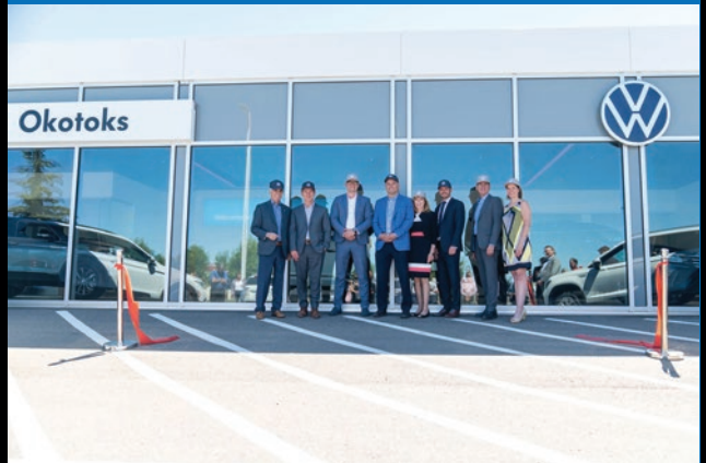
July 2022 Cutting the ribbon to officially open Okotoks Volkswagen, the newest member of the Wood Automotive Group.